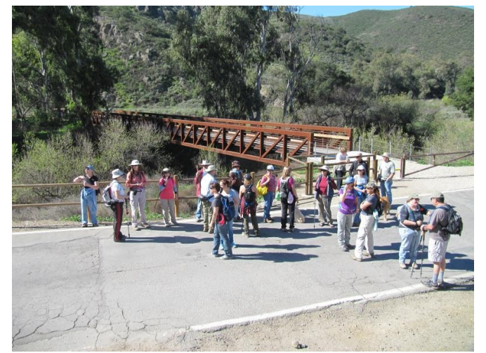
Lots of people use the Hill Canyon FR!