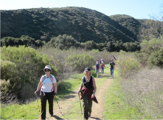
Hawk Canyon Trail